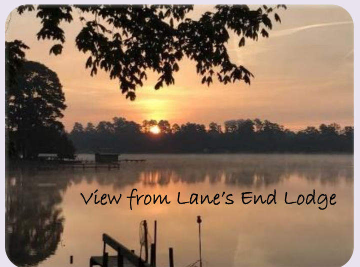
View from Lane's End Lodge